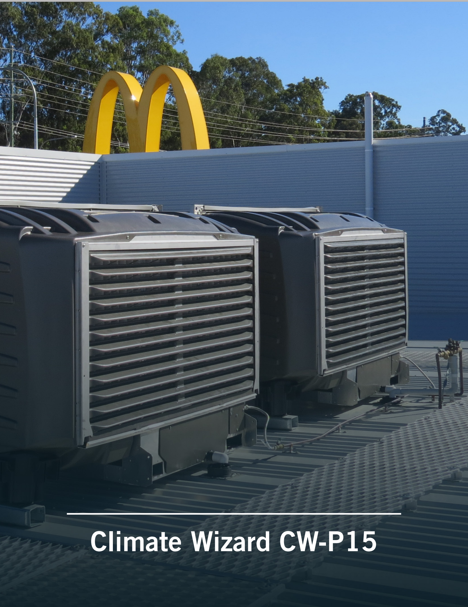
Climate Wizard CW-P15